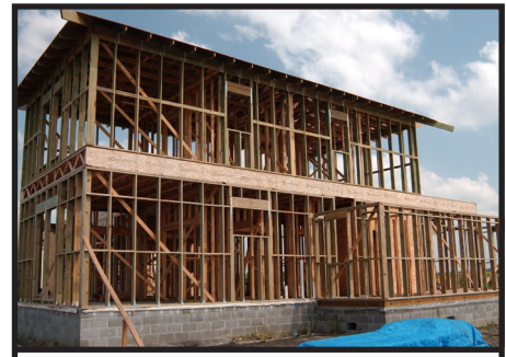
Advanced framing - larger lumber, but wider spacing and stack framing provides strength and more insulation with fewer studs and lower framing cost.