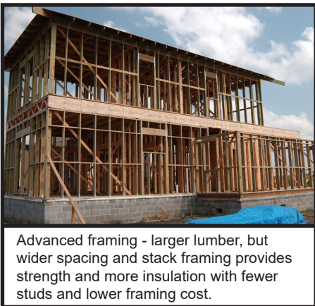
Advanced framing - larger lumber, but wider spacing and stack framing provides strength and more insulation with fewer studs and lower framing cost.