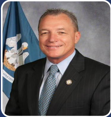
REP. HUVAL (R-Breaux Bridge)