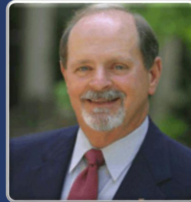
SEN. DONAHUE (R-Mandeville)

HEALTH/ACC INSURANCE: Provides relative to balance billing by and reimbursement of noncontracted facility-based physicians for covered health care services rendered in an in-network health care facility. (8/1/16) – Scheduled to be heard in committee on Wednesday.