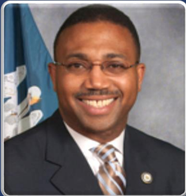
SEN. BISHOP (D-New Orleans)

INSURANCE COMMISSIONER: Provides relative to the authority of the commissioner to address violations of rules and regulations. (8/1/16)