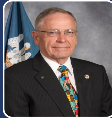
REP. LEBAS (D-Ville Platte)

INSURANCE/HEALTH: Provides relative to pharmacy benefit managers – Scheduled to be heard in committee on Wednesday.