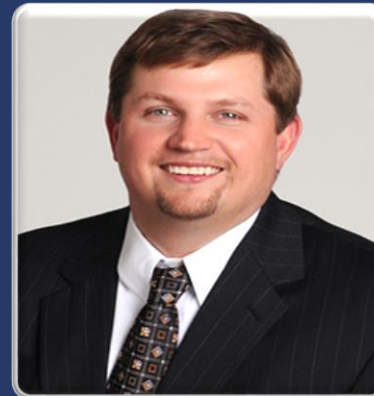
REP. THIBAUT (D-New Roads)

INSURANCE/HEALTH: Provides relative to reimbursement of noncontracted healthcare providers of emergency medical services