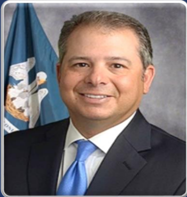
REP. C. BROWN (D-Plaquemine)