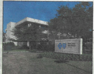
Blue Cross Blue Shield of Louisiana building in Baton Rouge